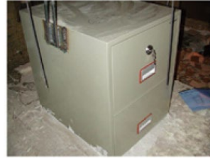
1 Before heating

NT FIRE 017-60 Paper: The safe is heated in a furnace for 1 hour to 945° C. During this time, the internal temperature of the safe may not rise by more than 150° C. Safes in this category provide one hour of protection for paper by keeping temperatures below 177° C, the point at which paper chars or combusts.