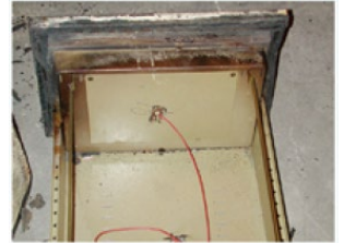
4 Interior of tested drawer