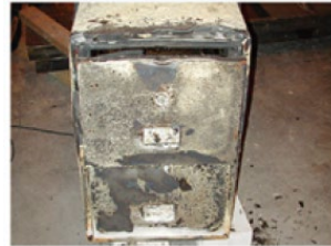
3 After heating